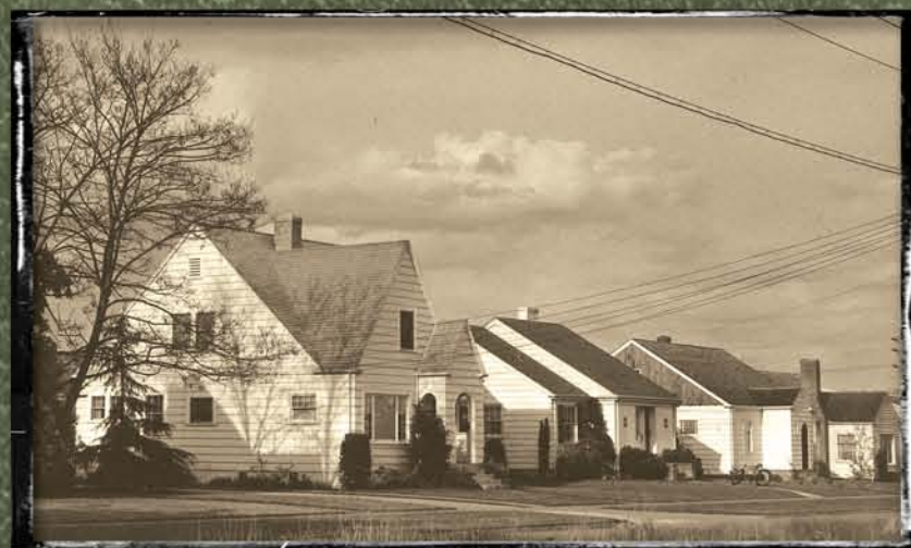
Puyallup Residential Street