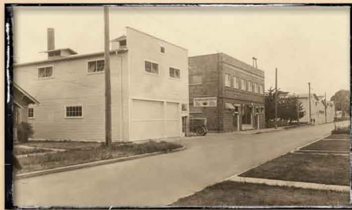
Cover: Meridian Avenue and Main Street looking North (Meeker Mansion Photo Collection) < Looking North on Meridian Street (Puyallup Public Library Collection) Hugh & Clark Feed Co., West Main Street (Puyallup Public Library Collection) ^