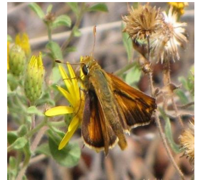
PAWNEE MONTANE SKIPPER MOTH