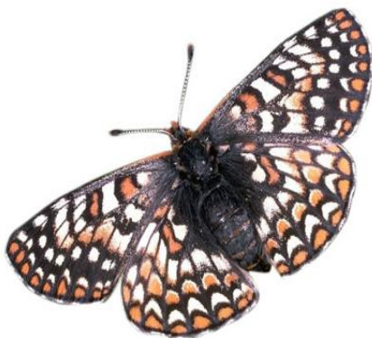
TAYLORS CHECKERSPOT BUTTERFLY