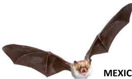
MEXICAN LONG-NOSED BAT